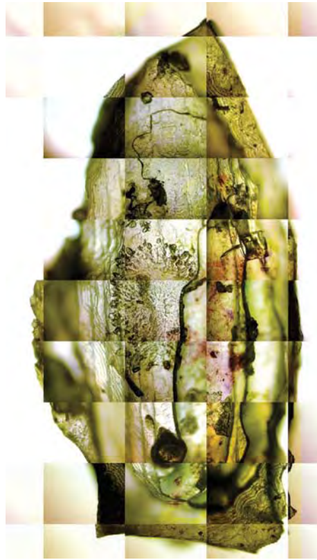
TISSUE CULTURE & ART

Once the cells fully developed into the shape of wings, the artists photographed them under colored LED lights on a microscope stage and displayed the cultures and the photos in the gallery. The exhibition, “If Pigs Could Fly,” suggested both the possibilities of biotechnology, and its limits. Some people came to the gallery expecting to see