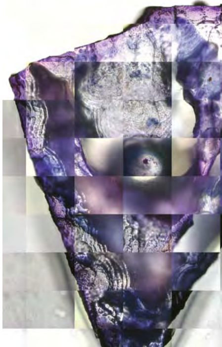
TISSUE CULTURE & ART

“The Stone Age of Biology” installation. The artists grew mice muscle and fish tissue over hydrogels in the shape of miniature prehistoric stone artifacts.